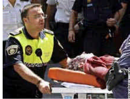
An injured passenger is taken away on a stretcher after the train derailed.